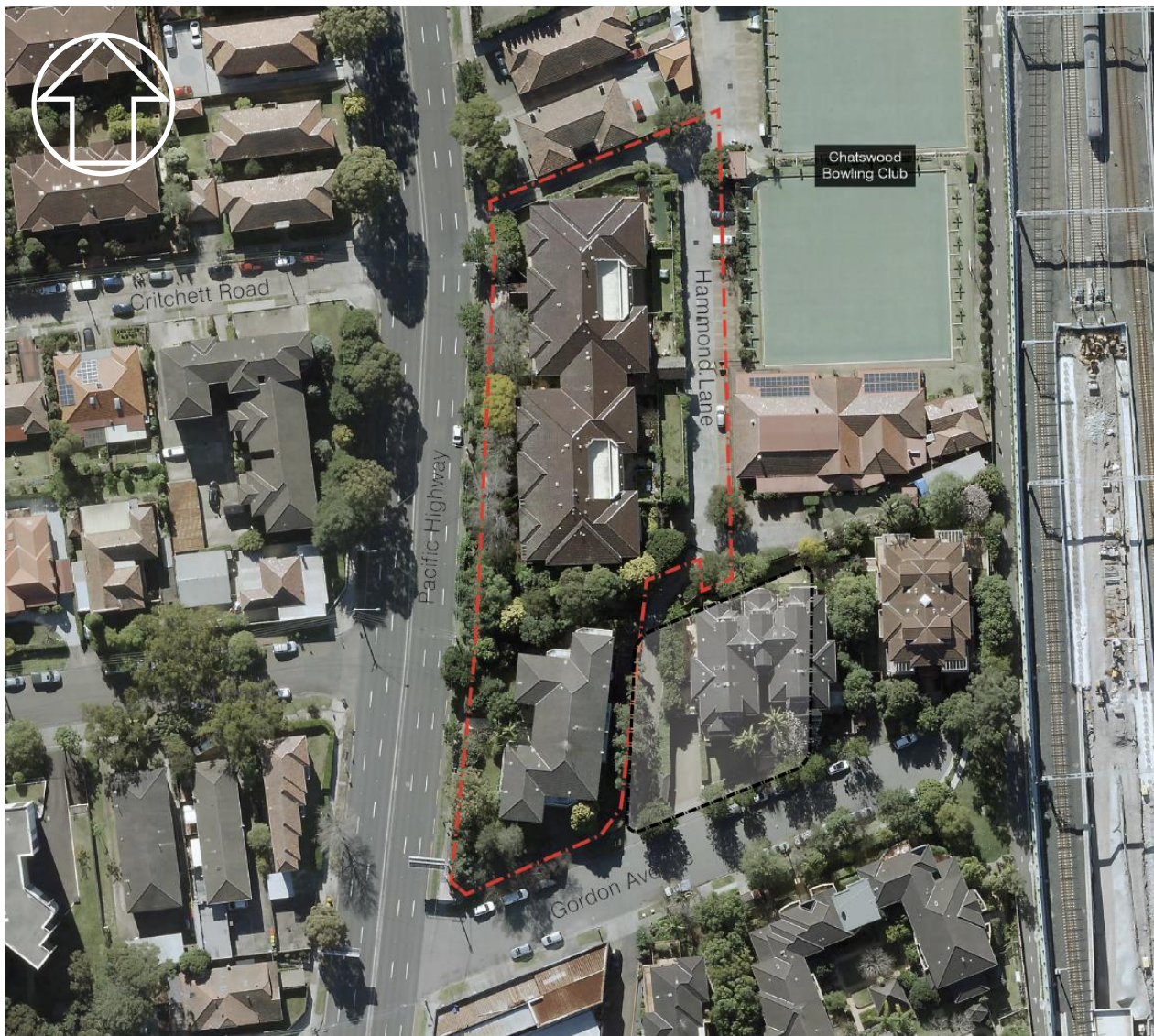
Figure 1 Proposal site location

The Proposal site is currently occupied by two multi story residential buildings at 641-653 & 655-655A Pacific Highway, Chatswood respectively. The location of the project site as shown in Figure 1 is bounded by a two storey residential apartment development to the north, Gordon Avenue to the south, Chatswood Bowling Club and an existing three storey residential apartment building (which has planning proposals with Department of Planning and Environment for a 29 storey mixed use development) to the east and Pacific Highway to the west. The site is approximately 70 metres (m) from the North Shore railway line to the east.